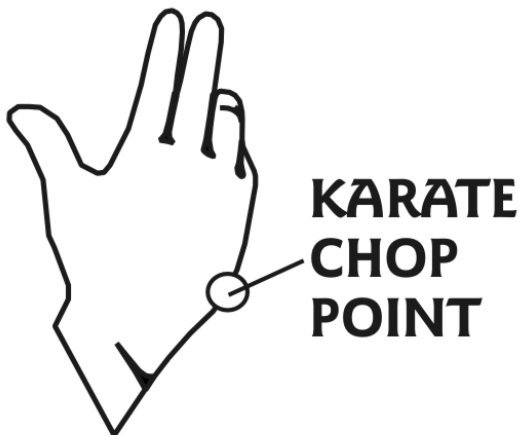
Chart © Copyright 2003 Gwenn Bonnell, All rights reserved EFT developed by Gary Craig www.emofree.com